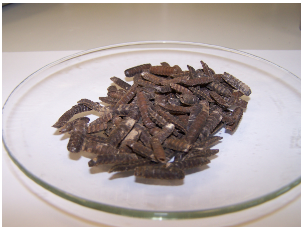
After pupae shed their skin, pupal exuviae remain as residual stream.

At the ACHEMA from June 11–15, 2018 in Frankfurt am Main, Fraunhofer IGB will be available for further information and discussions at the Fraunhofer joint stand in Hall 9.2, Booth D66.