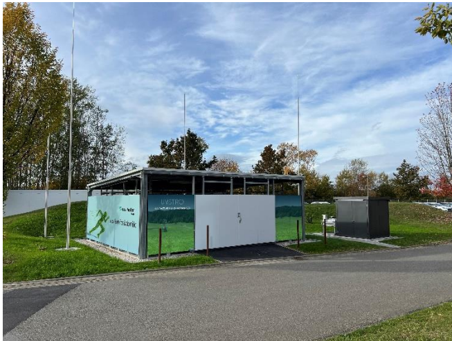
Fig.32 The H2 power plant at the Fraunhofer IWU research factory. For climate-neutral production, the supply of renewable energy, including "green" storage technologies, is a key component. The H2 power plant consists of an electrolyzer, hydrogen storage, fuel cell, and an additional battery storage system.