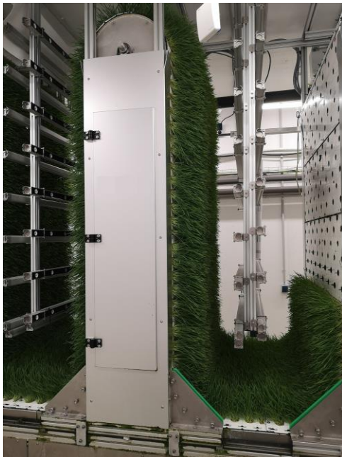
Fig. 2 Wheatgrass in the OrbiPlant® test facility at Fraunhofer IME