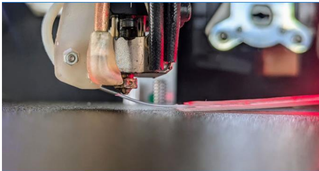
Fig. 4 The FEAM process uses fiber material made of glass, which is applied to any substrate via a polymer coating without affecting its optical properties.

The Fraunhofer Institute for Machine Tools and Forming Technology IWU is a driver for innovations in the research and development of production engineering. Around 670 highly qualified employees work at our locations in Chemnitz, Dresden, Leipzig, Wolfsburg, and Zittau. We open up the potential for competitive manufacturing in automotive and mechanical engineering, aerospace technology, medical engineering, electrical engineering, and precision and microengineering. We focus on scientific developments and contract research regarding components, processes, methods, and the associated complex machine systems and their interaction with humans – the entire factory. As the leading institute for resource-efficient manufacturing, we bank on highly flexible, scalable cognitive production systems using nature as an example. We consider the entire process chain using regenerative systems and circular economy in this context. We develop technologies and intelligent production plants and optimize forming, cutting, and joining manufacturing steps. Our range of services includes the development of innovative lightweight structures and technologies for processing new materials, functional transfer to assembly groups, and the latest technologies of additive manufacturing (3D printing). We present approaches for large-scale production of essential hydrogen systems, thus contributing to the transition to renewable energies.