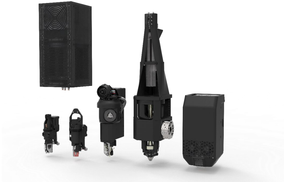
Fig. 1 Left bottom: WEAM Printer (outer) and FEAM Printer are ideally suited motion systems for 3D printers in environments with limited space but requiring speed and flexibility. The print heads are compact and lightweight. The media supply (wire or fiber, polymers, compressed air) is handled by an external supply unit (shown directly above the print heads). For larger machines or when more space is available: WEAM Machine (center) requires no external supply. WEAM Robot (second from right) is designed for larger motion systems, primarily processes two-component polymers, and can print glass fibers or glass fiber-reinforced plastics onto metals. Far right: AUCA , designed for robotic guidance. Shown is the unit that can place and adjust the length of four cables simultaneously.