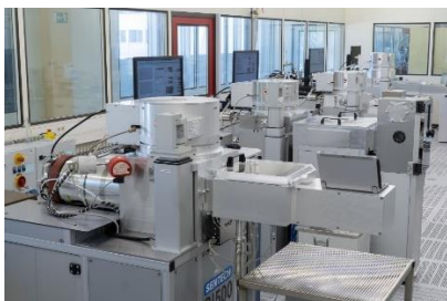
As part of the APECS pilot line, the area of dry etching technology in the Fraunhofer IAF clean room for 6" wafers is being expanded.