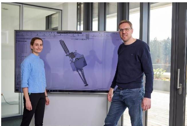
Fig. 2 The system features a measuring unit equipped with special ultrasonic waveguides and built-in cooling, along with a specially developed software program with a patented analysis algorithm.