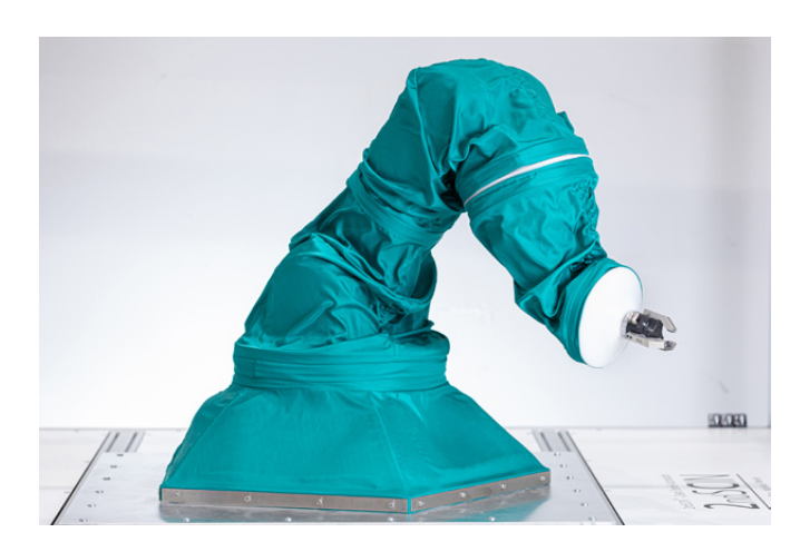
2ndSCIN® is a protective enclosure for robots and other automation components intended for use in clean rooms.

For many years, Fraunhofer IPA has also been offering processes for particle emission, outgassing, ESD, and other requirements. The Tested Device® test mark is awarded to the products tested, and visitors to the booth can also find out more about this at the stand. The product- and customer-specific test report provides companies with confirmation of the cleanliness and cleanroom suitability of their systems, devices, or consumables. The tests include the production environments of atmospheric cleanrooms, dry cleanrooms, and vacuum conditions.