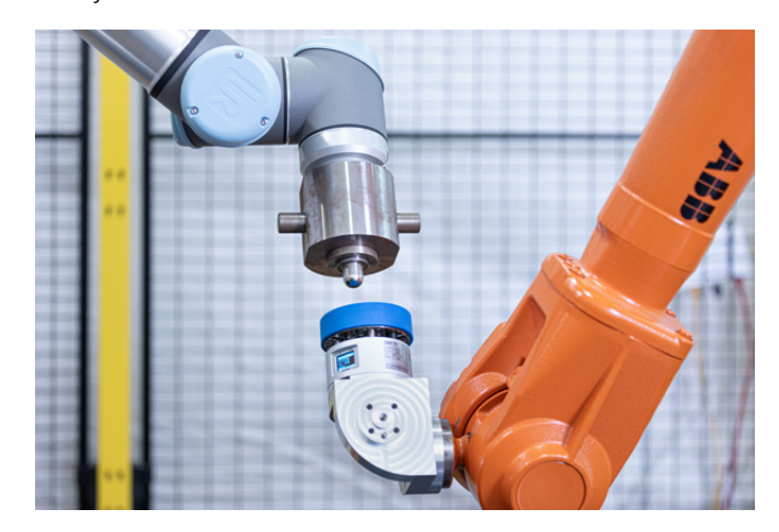
Cobots are measured once on the automatic collision test bench, generating a collision model that can be used for safety design.

PRESS RELEASE 12 June 2025 || Page 4 | 6