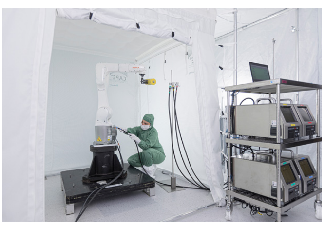
With its test marks, Fraunhofer IPA has already tested and certified over 2,500 products and materials worldwide for their cleanliness and cleanroom suitability.