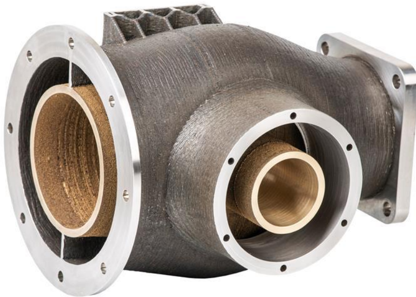
Fig. 2 A component of the Expert Table “Hybrid Manufacturing to Expand AM Limits” by Francesco Bruzzo (Fraunhofer IWS), focusing on CAD/CAM interfaces for complex components, the optimization of hybrid process chains, and in-situ process control in the DED process.