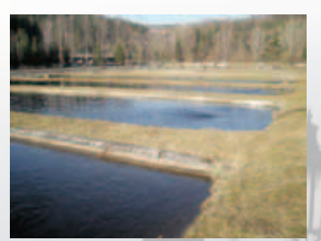
Trout farm in Anin of Klatovske Fishery Ltd.