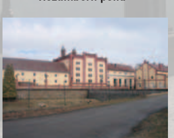
Traditional local brewery Regent Trebon