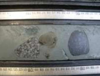
Pebbles in a sediment core from the Antarctic coastal waters. The pebbles were taken to open sea by icebergs and ultimately fell to the ocean floor. Download in 300 dpi