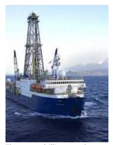
The ocean drilling vessel JOIDES Resolution with which the IODP brought drill cores from the Antarctic coastal waters to the surface in 2010. Download in 220 dpi