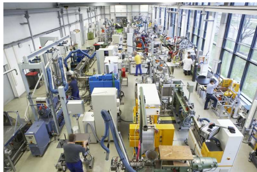
Pilot plants in the IPF