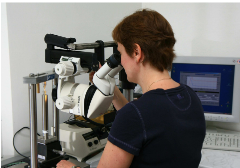
Mini composite impact test developed at IPF