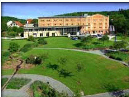
Alte Maelzerei/Congress venue