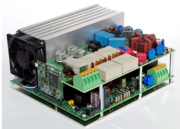
New materials boost efficiency: Fraunhofer ISE develops three-phase 10 kW UPS inverter with a volume of just five liters and an efficiency of 98.7 percent.

Freiburg, September 3, 2015 No. 23/15 Page 4