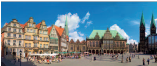
Bremen, Marktplatz