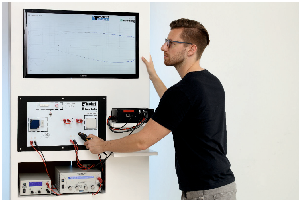
Demonstrator for the dynamic real-time analysis of power electronic components using novel measuring technology based on the injection of artificially generated noise signals, consisting of test network, measurement device, load and DC source.

The application of Cognitive Power Electronics 4.0 to this scenario allows it to go beyond state-of-the-art oscilloscope-based analysis: A new instrument was developed that uses artificially generated noise signals to fully characterise power electronic components in the frequency range. This allows the measurement of individual devices as well as system networks in real time at high currents and under voltages up to 1000 volts. By means of a special evaluation software, characteristic parameters and dynamic behavior can be determined very accurately.