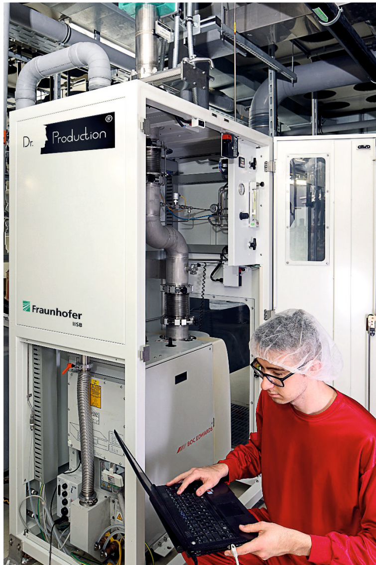
Vacuum system with 100% real-time facility state monitoring for deposition processes in semiconductor manufacturing. A machine-learning algorithm predicts the rest of useful life of the vacuum system until contamination gets critical.

The application of Cognitive Power Electronics 4.0 to this scenario allows the continuous collection and visualization of the electrical parameters from the power electronics inside the vacuum system, providing 100% real-time facility state monitoring to the process engineers. Beyond that, a machine-learning algorithm was trained to predict the rest of useful life of the vacuum system until contamination gets critical. Based on this prediction, safety is improved and maintenance actions can be planned in-line with upcoming processing schedules.