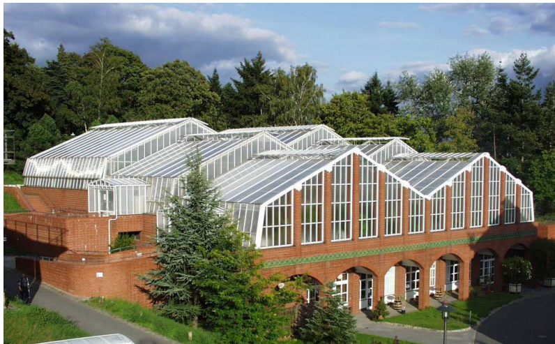
New Glasshouse & Rousseausaal