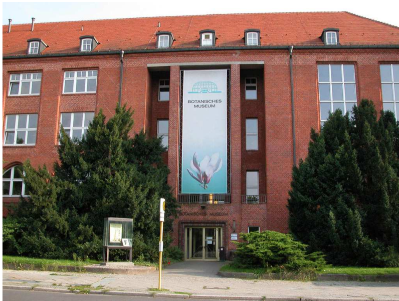
Botanical Museum

phone: +49 (0)30 838-50100 web: www.bgbm.org/en