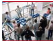
best in class processes for machining, assembly and logistics