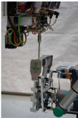
Figure 2 | Caption

Automated rudder hinge assembly in aircraft tail planes – Automated on-demand shim application to compensate component tolerances: a lightweight robot guides a rudder hinge under the dispensing system for liquid shim application.