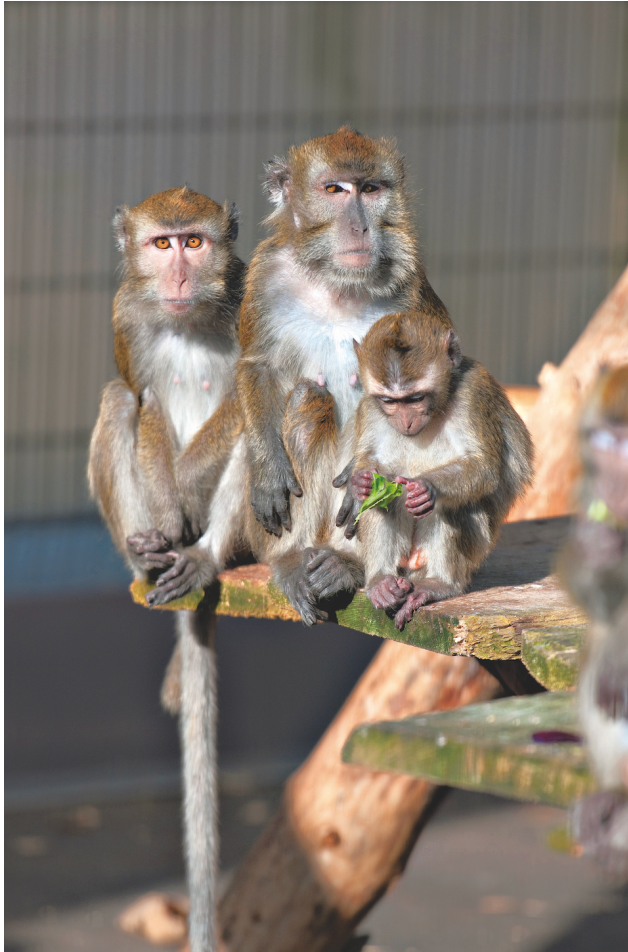
Long-tailed macaques ( Macaca fascicularis) in the animal husbandry facility at the German Primate Centre in Göttingen.