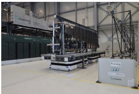
Figure 5 | Caption

Automated rudder hinge assembly in aircraft tail planes – Automated on-demand shim application to compensate component tolerances: a lightweight robot guides a rudder hinge under the dispensing system for liquid shim application.