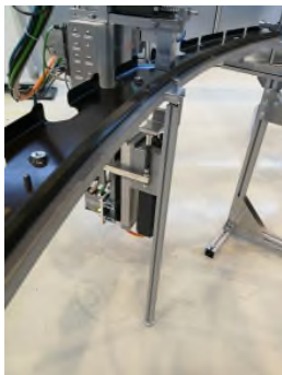
Figure 3 | Caption

Aircraft fuselage of the future: The Clean Sky 2 Multifunctional Fuselage Demonstrator (MFFD) in detail. It is currently being realized at Fraunhofer at the Research Center CFK NORD in Stade on a 1:1 scale with project partners.