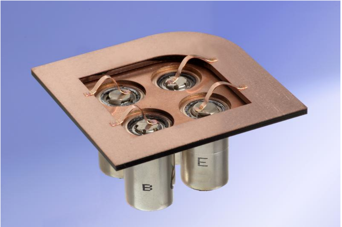
Picture 2: Battery cells (type 18650) contacted with a laser bonder.