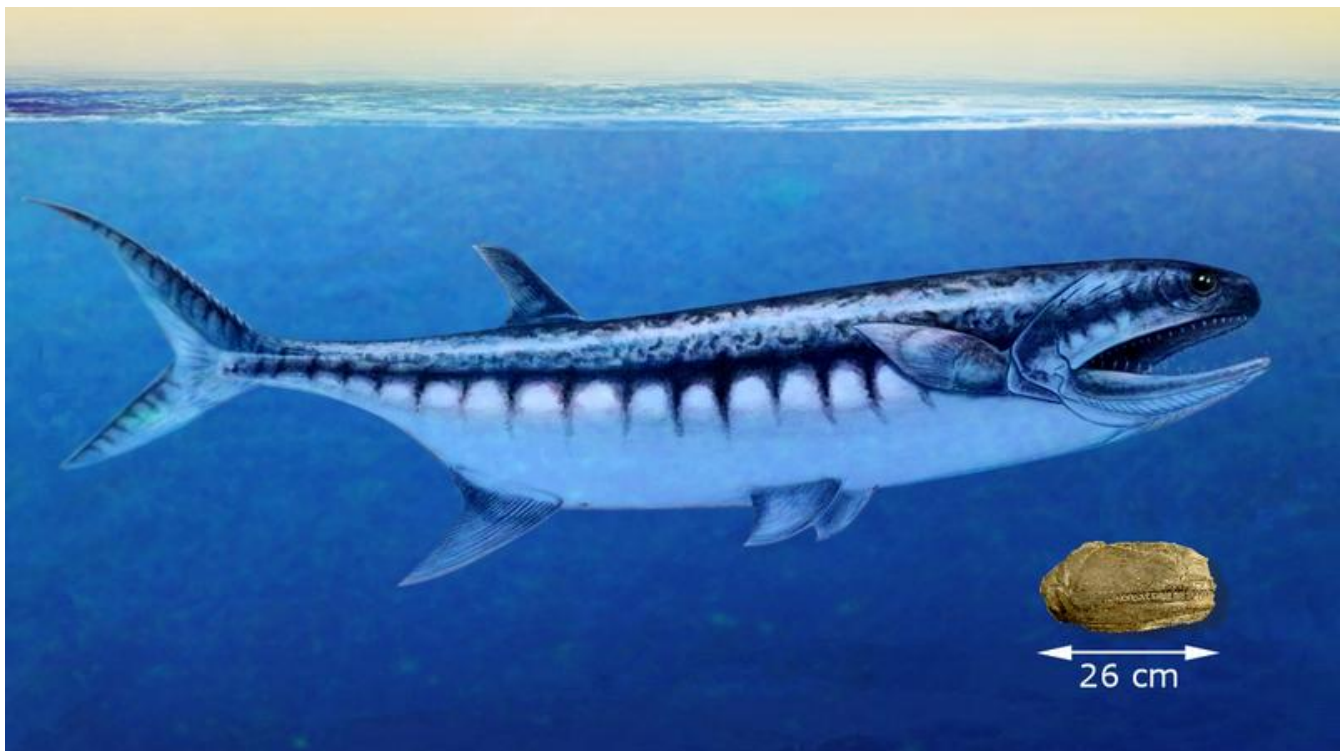
Possible look of the newly discovered predatory fish species Birgeria americana with the fossil of the skull shown at bottom right.

URL zur Pressemitteilung: http://www.media.uzh.ch/en/Press-Releases/2017/Top-predator.html