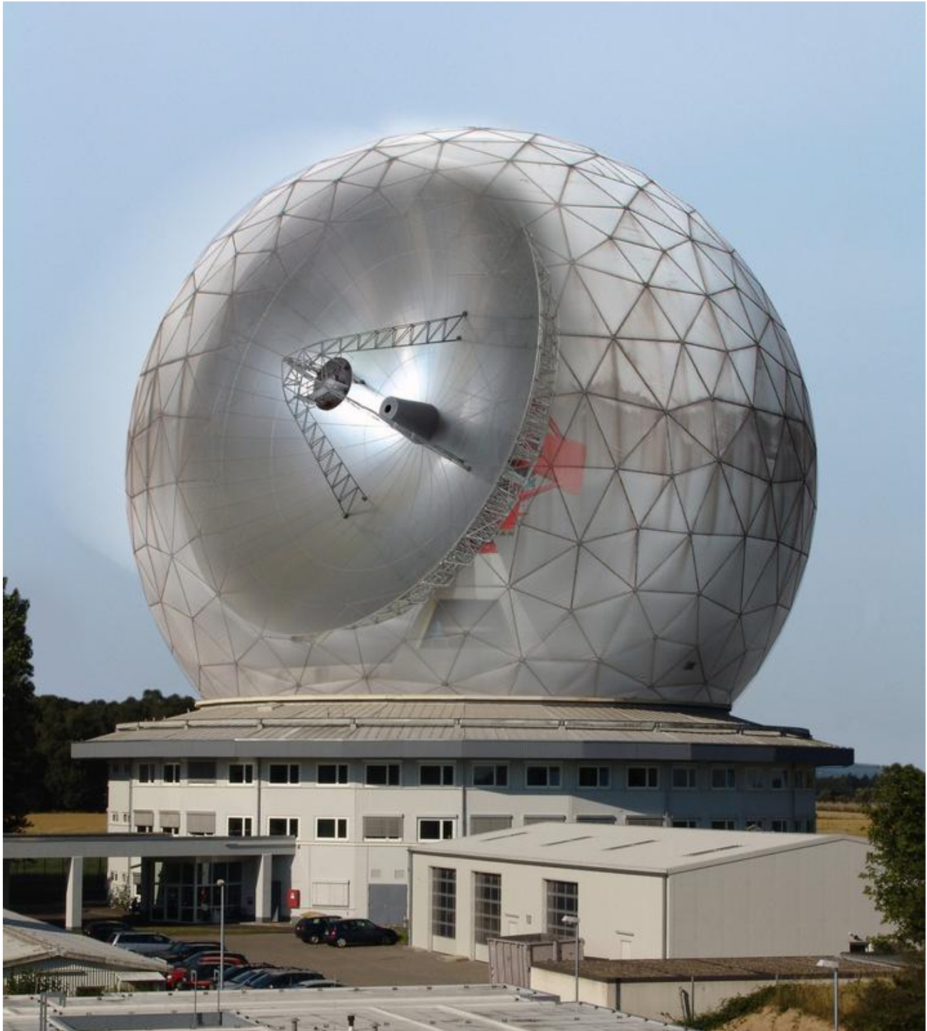
The space observation radar TIRA of Fraunhofer Institute for High Frequency Physics and Radar Techniques FHR in Wachtberg near Bonn in Germany.