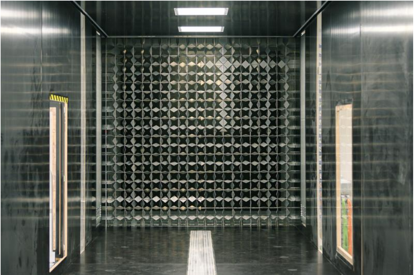
The active grid in the wind tunnel can stir up air flows to create realistic storm turbulence.