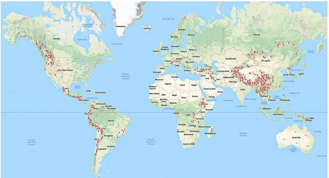
Global potential for seasonal pumped storage Hunt et al. (2020) Hunt et al. (2020)