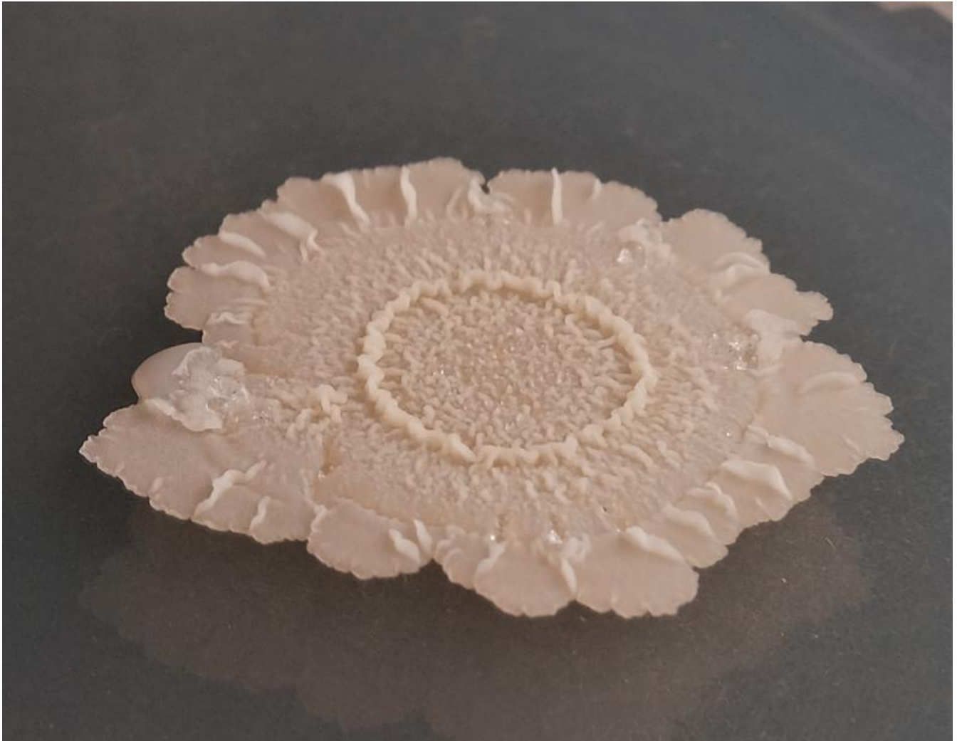
The microbe of the year 2023, Bacillus subtilis , forms biofilms with diverse structures.