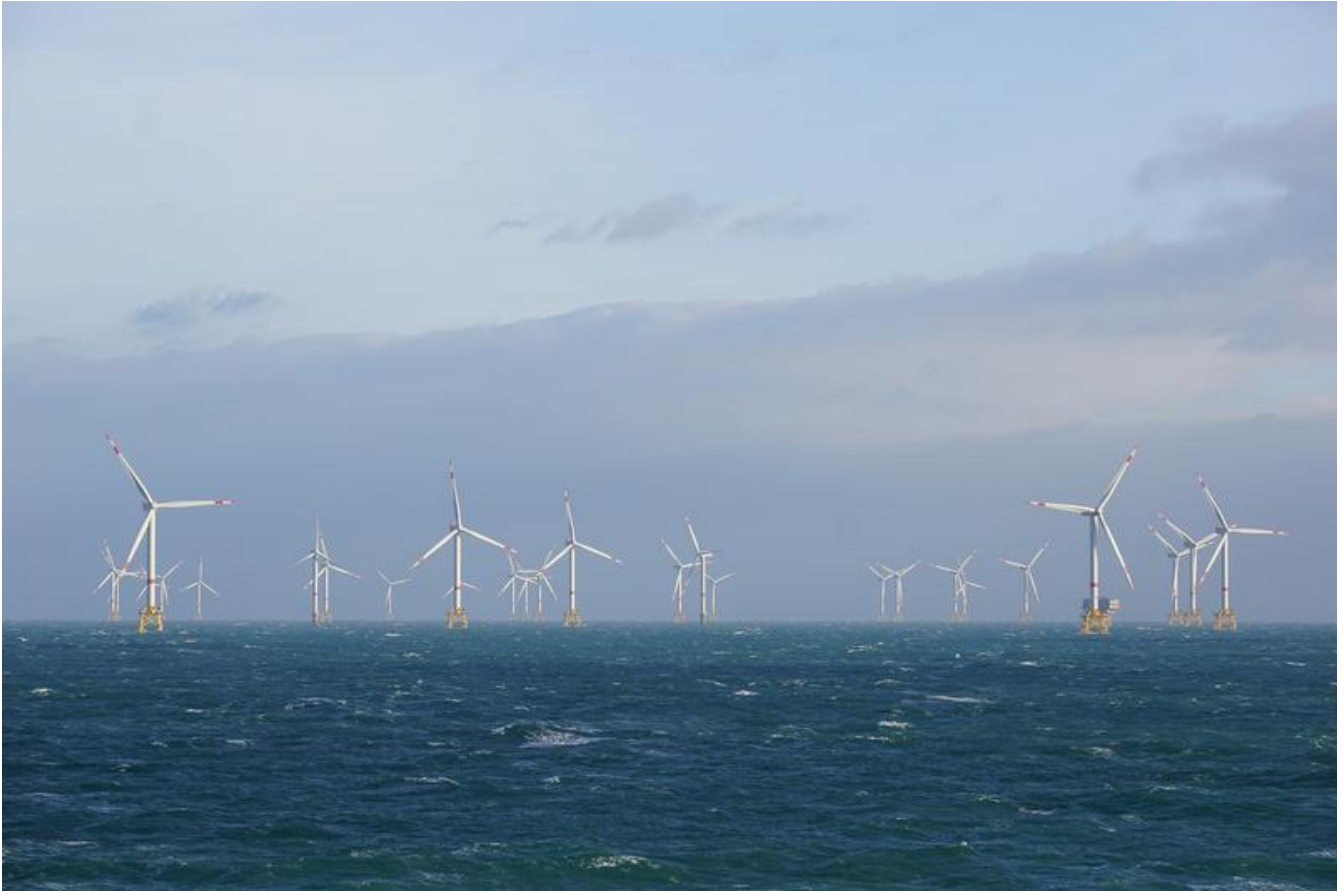
Offshore wind farm