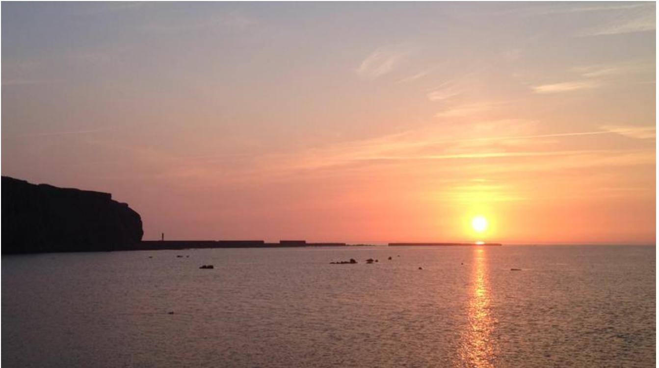
Sunset over the island of Helgoland in the German Bight, where the researchers from the Max Planck Institute for Marine Microbiology obtained their samples.