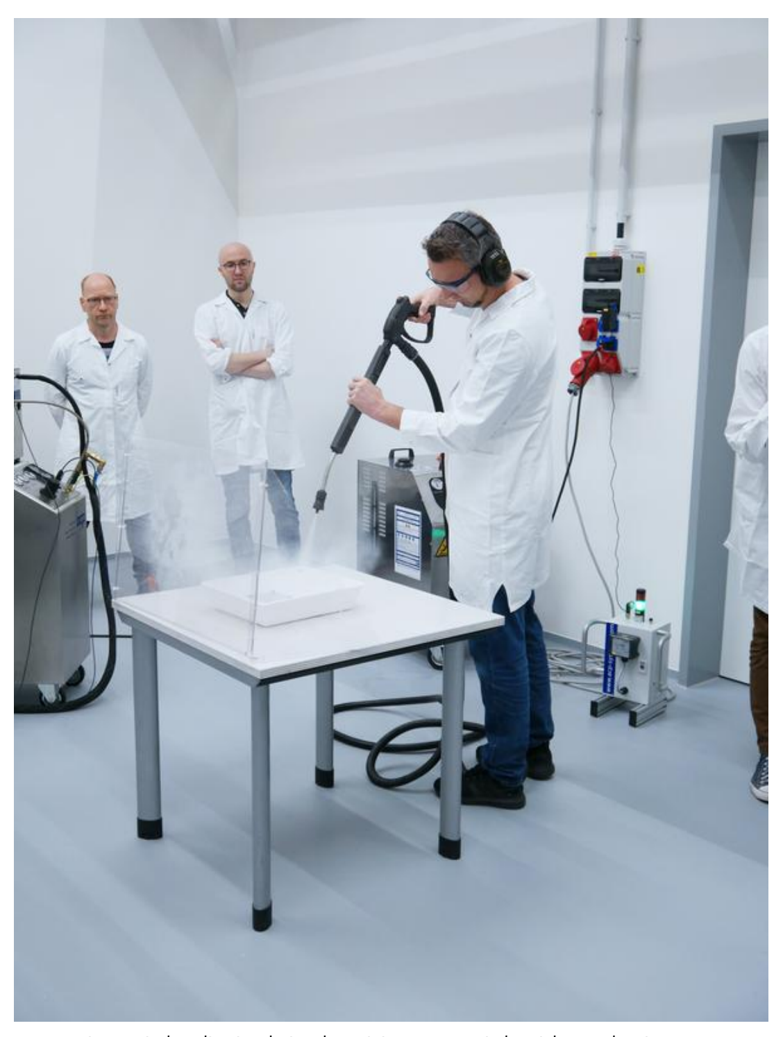
Cleaning processes in practical application during the training course on industrial parts cleaning @ Fraunhofer-Business Area Cleaning