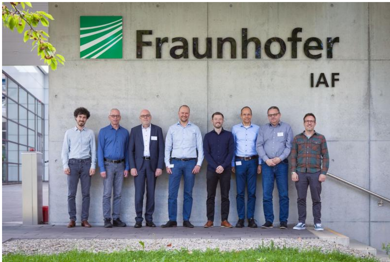
Group picture of the project partners at the kick-off meeting of Magellan at Fraunhofer IAF