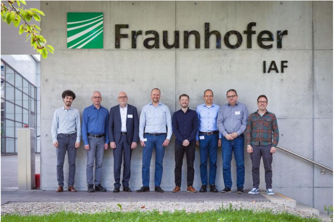
Group picture of the project partners at the kick-off meeting of Magellan at Fraunhofer IAF