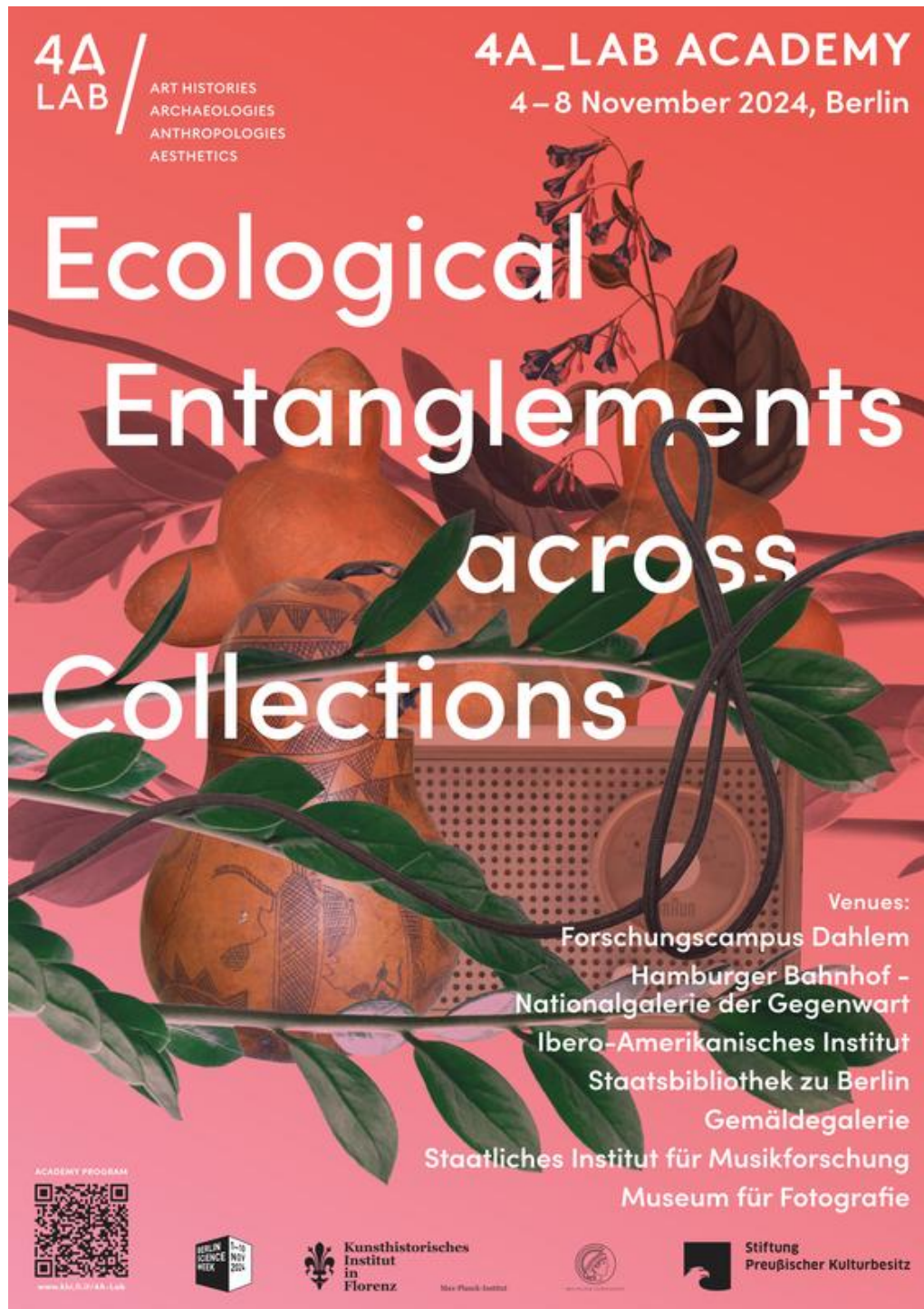
4A-Lab Academy "Ecological Entanglements across Collections – Plant Lives and Beyond"