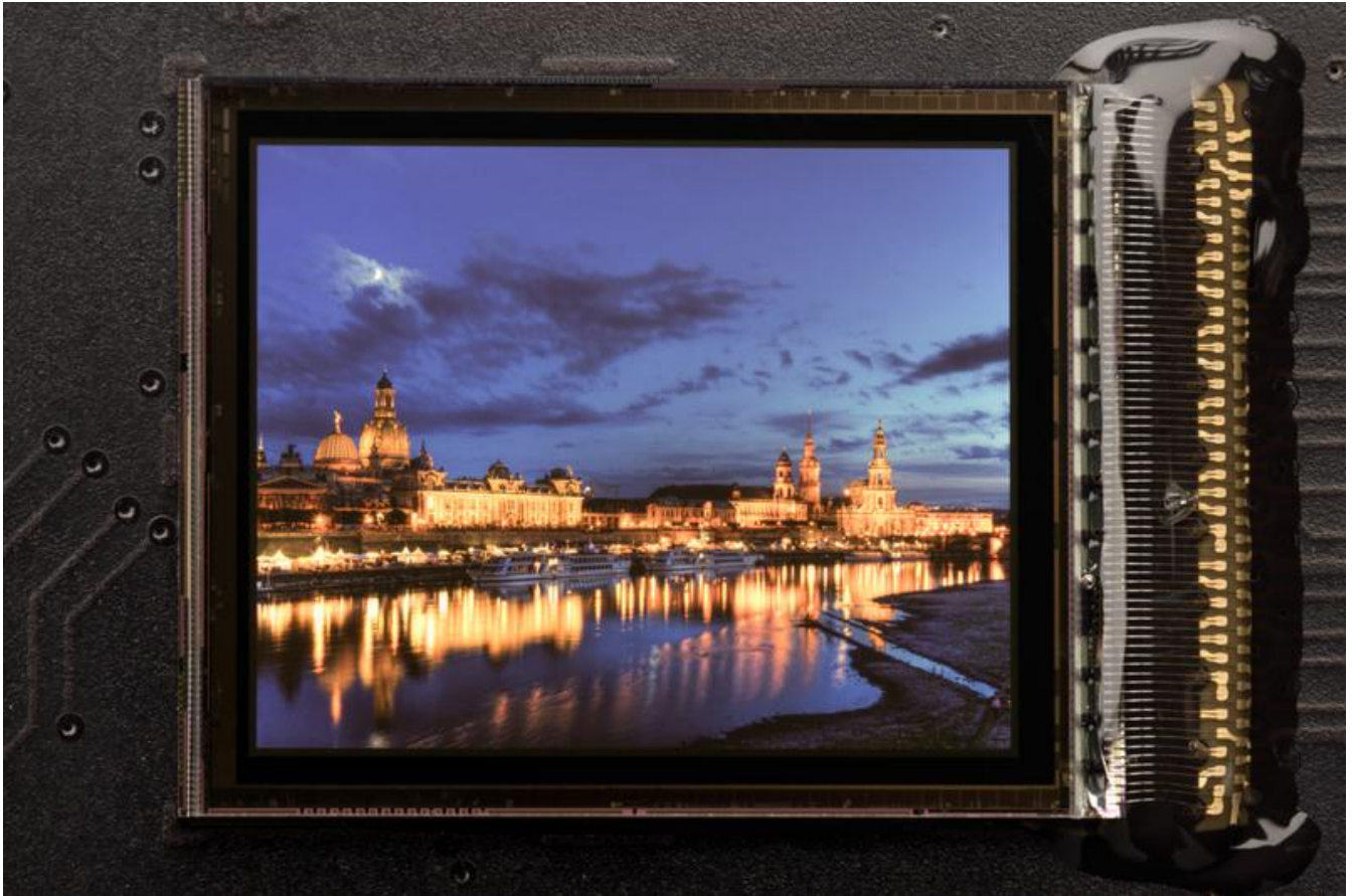
0.62-Inch SXGA High-Voltage CMOS Backplane with OLED