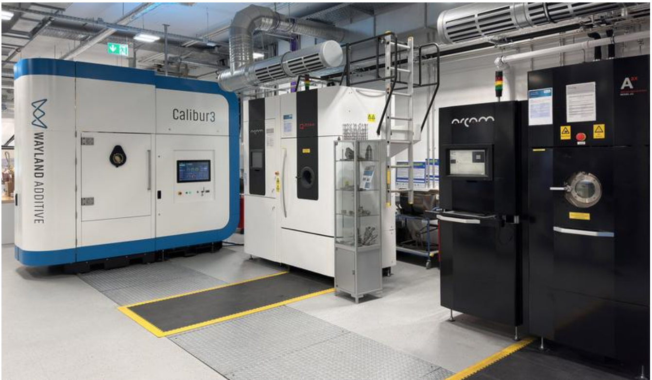
View into the Innovation Center Additive Manufacturing ICAM® with all three facilities for Electron Beam Powder Bed Fusion (PBF-EB) available at Fraunhofer IFAM Dresden; left: Wayland Calibur3 Fraunhofer IFAM Dresden