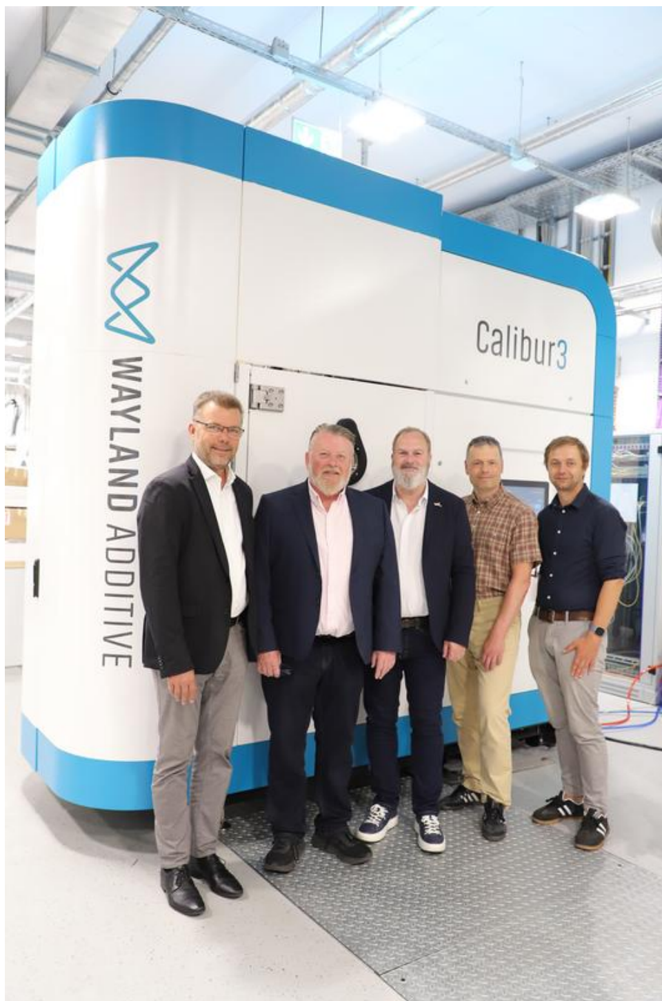
Representatives of Fraunhofer IFAM Dresden and Wayland Additive in front of Calibur3 Fraunhofer IFAM Dresden