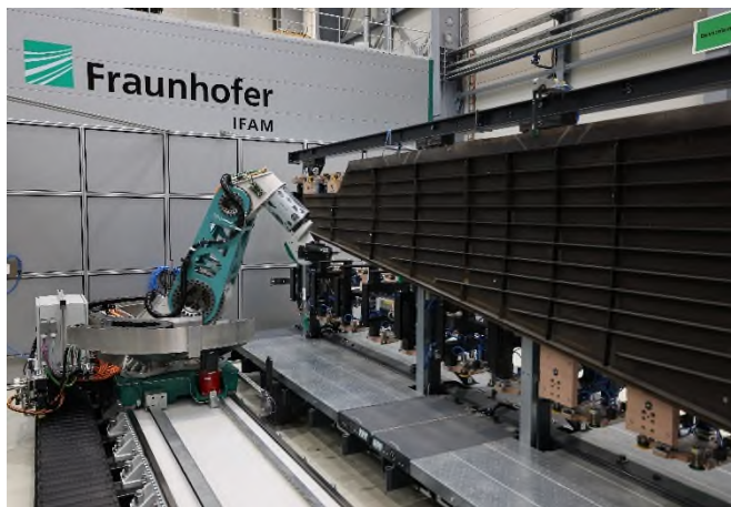
Figure 1 | Caption

© Fraunhofer IFAM, but can be published in reports about this press release. www.ifam.fraunhofer.de/en/Press_Releases/Downloads.html