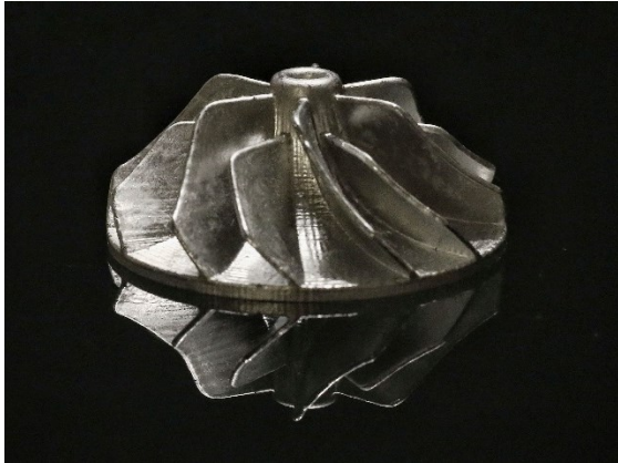
Sintered part of an impeller, manufactured with GelCasting

Further information on Additive Manufacturing at Fraunhofer IWS.