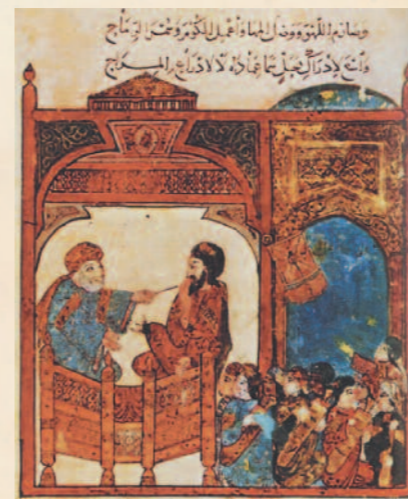
Teaching Session. From Hariri's Maqamat, Ms. ar. 5847, fol. 18v (BNF Paris). Quoted from Children and Youth in History, Nr. 243, http://chnm.gmu.edu/cyh/primary-sources/243 (19.8.2011).