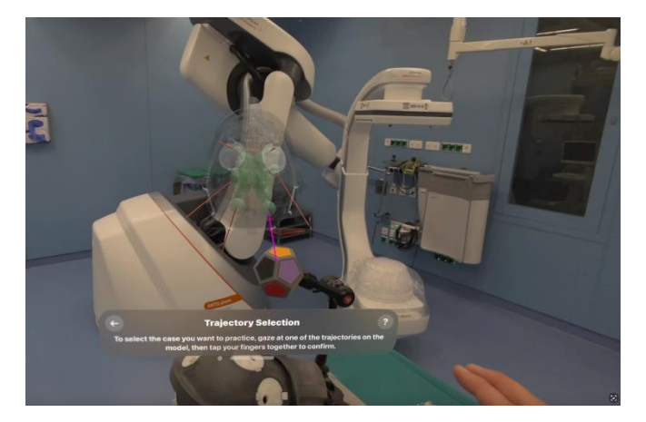
Fig. 3 Field of view of the surgeon: The actual operating room is visible in the glasses. The app "places" individual patient data on the actual head. First, the surgeon selects the access path (trajectory) to the operation site. The fully automatic registration (calibration, real-time recognition of the surgical instrument) takes just one second.