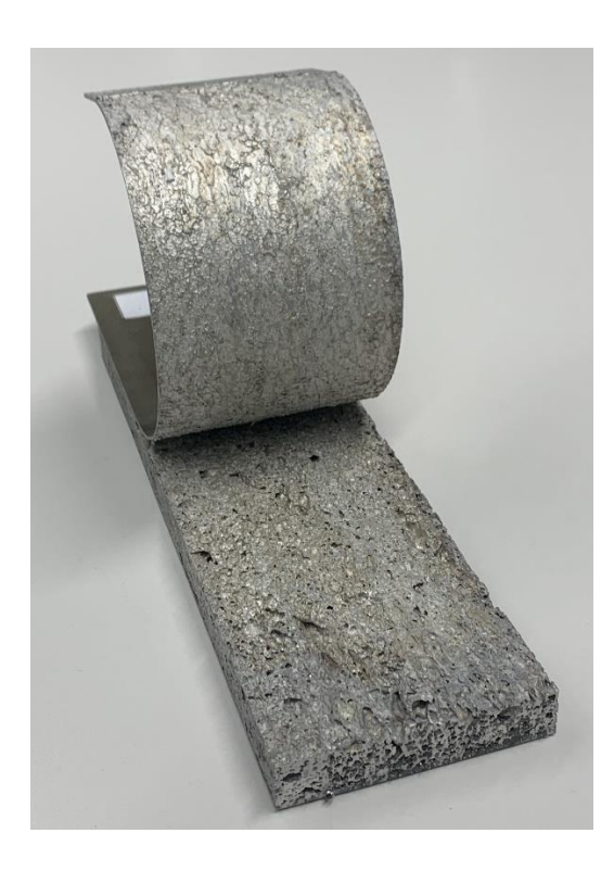
Fig. 3 Sticks: The drum peel test (DIN 53 295) proves that the cover sheets and sandwich core form a stable bond.