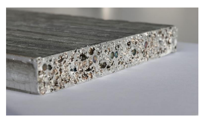
Fig. 1 The composite material January 30, 2025 || Page 3 | 4 HoverLIGHT has a core made of aluminum foam with encapsulated hollow spheres (visible in the crosssection as round openings). The combined damping effects of foam and particle-filled hollow spheres are comparable to those of magnesium.