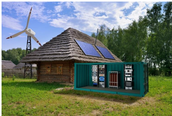
Fig. 1 Hydrogen-based microgrids are perfect for establishing decentralized power networks with renewable energies

HyTrA and HyGO receive funding from the Federal Ministry for the Environment, Nature Conservation, Nuclear Safety, and Consumer Protection.