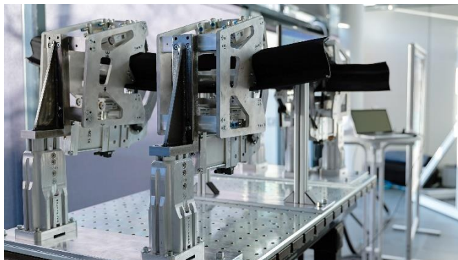
Fig. 3 Clamping element developed at Fraunhofer IWU for automated clamping and joining of thermoplastic carbon fiber composites in aircraft doors (e.g., crossbeam).