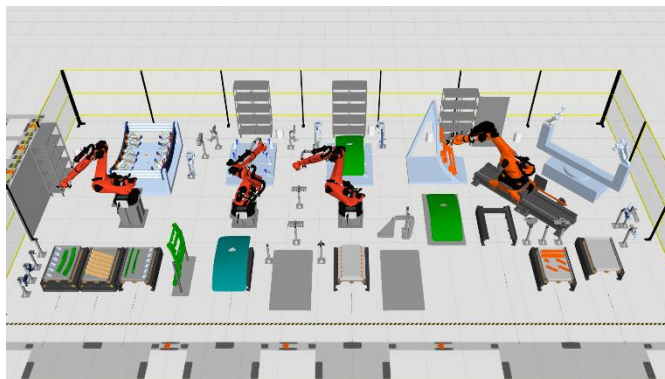
Fig. 1 Screenshot (Video available online): Fully automated assembly/joining processes and logistics for the door structure.