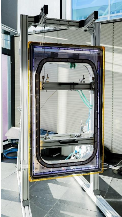
Fig. 5 Fraunhofer LBF developed and validated experimental measurement technology for sensor-integrated aircraft door seals in the TAVieDA project; project partner Trelleborg developed the new sealing geometry with, for instance, the help of finite element simulations. In this process, the component under consideration is virtually divided into a limited number of small, simple geometric elements (finite elements).

About the TAVieDA Project: TAVieDA (Rapidly Installable and Durable Aircraft Door System Using the Versatility of a Tolerance-Compensating Seal and Automated Assembly) is a collaborative project between Fraunhofer IWU, Fraunhofer LBF, Airbus Helicopters, and Trelleborg. The German Federal Ministry for Economic Affairs and Climate Action funded TAVieDA as part of the national aviation research program (LuFo).