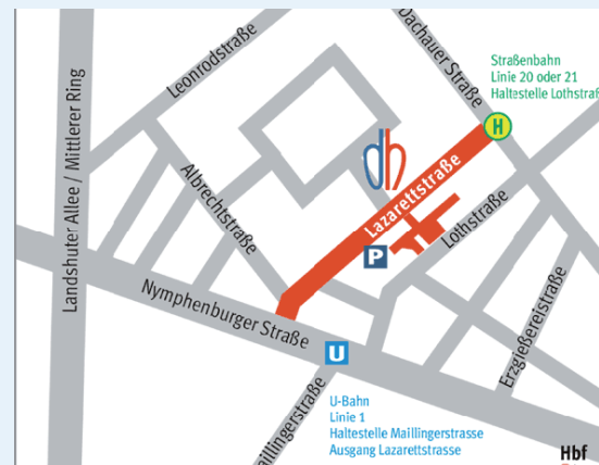
Map German Heart Centre, Lazarettstr. 36, 80636 Munich