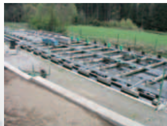
Family trout farm, Sumavsky

The second tour will focus on Trout farming in the Czech Republic including visiting a small family trout farm „Sumavsky pstruh“ near Vacov and the biggest trout farm in the Czech Republic, Klatovske Fishery Ltd. After visiting trout facilities, participants of this tour will go to Klatovy town where a short sightseeing trip and lunch will be organized. This tour will continue with an excursion of the modern fish processing line of Klatovske Fishery Ltd. in Klatovy before returning to Prague.