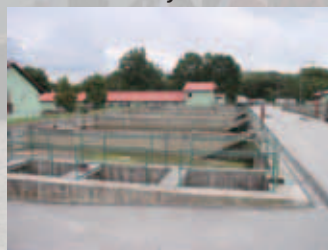
Stew in Nove Hradky fish farm