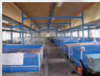
Fish hatchery in Nove Hradky fish farm