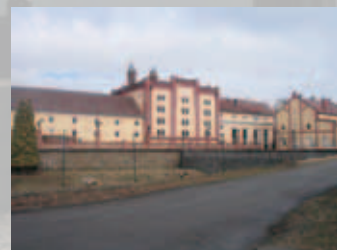
Traditional local brewery Regent Trebon