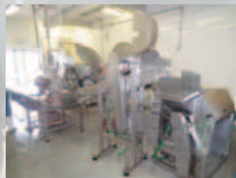
Fish processing line of Klatovske Fishery Ltd. in Klatovy