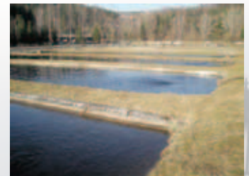
Trout farm in Anin of Klatovske Fishery Ltd.