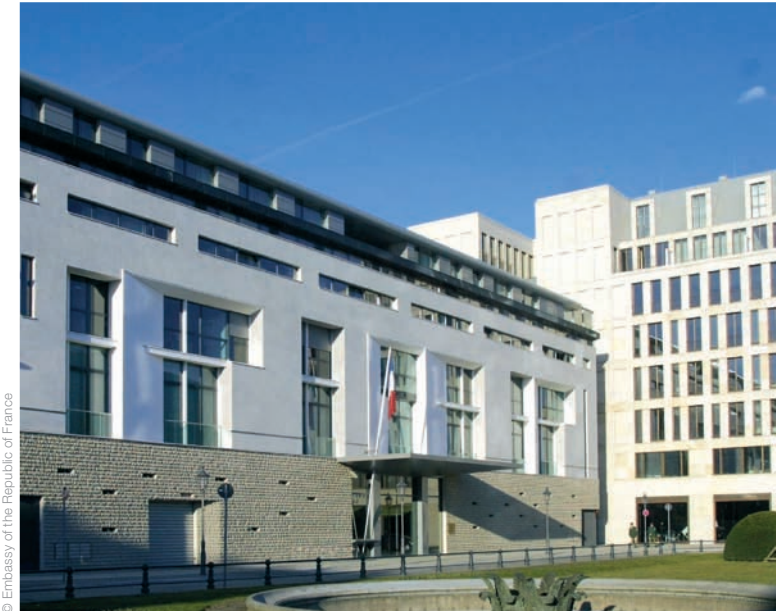
© Embassy of the Republic of France

12 February 2016, 9:30 am, French Embassy, Berlin, Germany