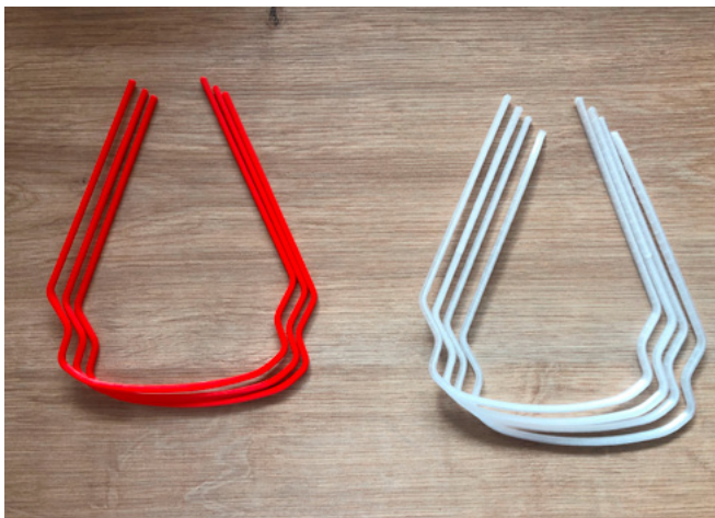
3D print sample of side pieces for safety goggles made from PLA and PC.

Hospitals are currently facing shortages of many medical consumables, not just face masks. Rapid help is needed. These are problems with which the Project Group for Automation in Medicine and Biotechnology PAMB, Mannheim, a spin-off from Fraunhofer IPA, is well acquainted. After all, it engages with medical professionals on a daily basis. Its headquarters are located at the heart of the grounds that house Mannheim University Hospital and it has a coronavirus diagnosis station right outside its window. The project group's medical technicians have provided rapid, direct support to the doctors.