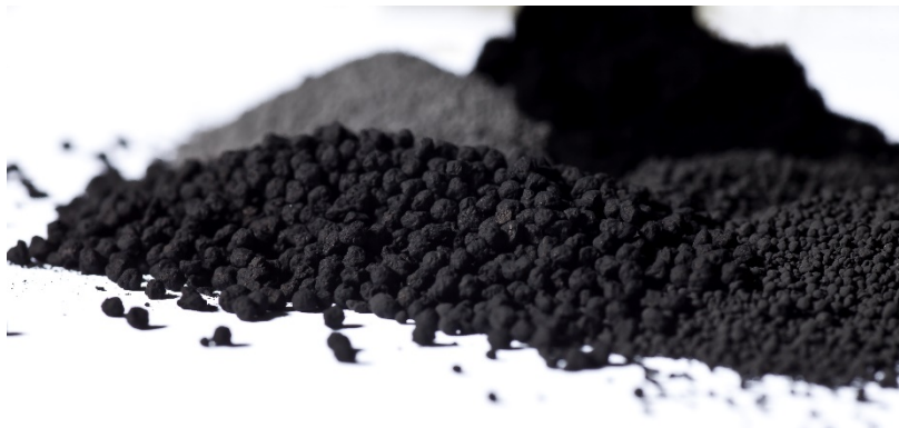
Carbon Black