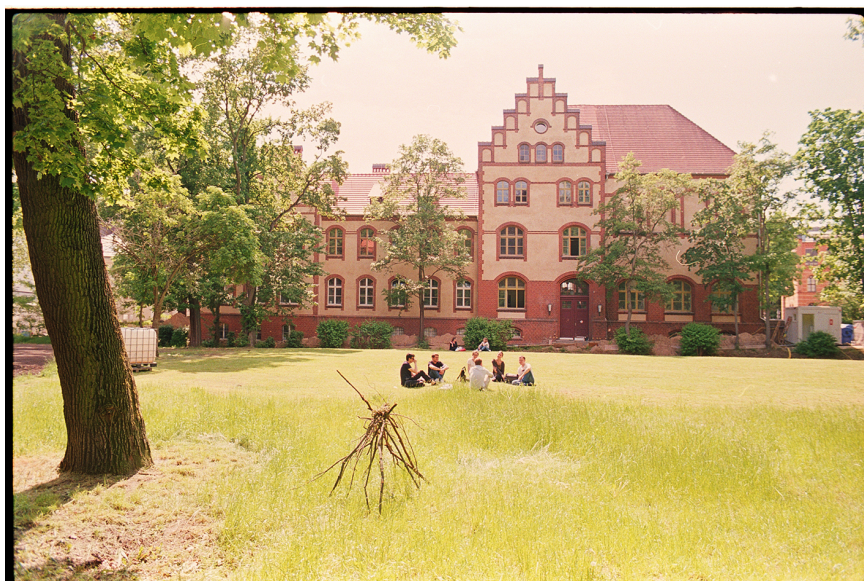
The Campus Nord of the Humboldt-Universität

With the Open Humboldt Festival, the Humboldt-Universität unites science with art.