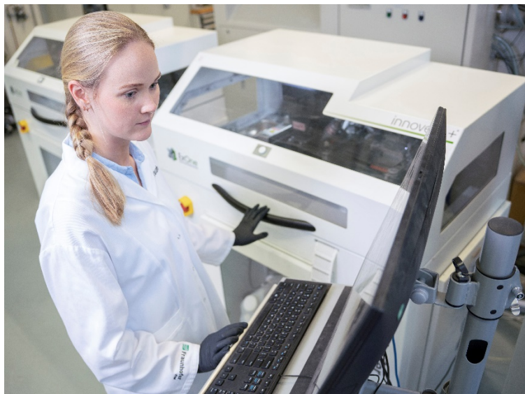
Working with the ExOne Innovent+ at Fraunhofer IFAM.