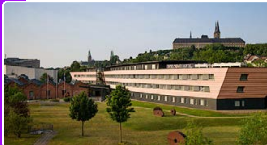
Welcome Hotel Bamberg

A single rooms is available at the WELCOME Kongresshotel Bamberg at a price of 124 € per night including breakfast. The rooms can be booked using the keyword „SUPER22“ via the booking link available on our website.