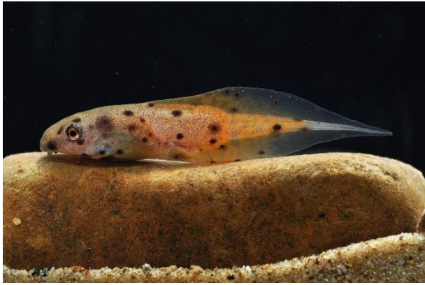
Caption: Unusual colour variation of the larva of a tree frog ( Polypedates macrotis ). The function of the conspicuous stippling is unknown.

The Leibniz Association combines 96 independent research institutes. Their focus ranges from the natural, engineering, and environmental sciences to the humanities and the business, space, and social sciences. The Leibniz institutes focus on relevant social, economic, and ecological issues. They perform knowledge-oriented and applied research (also among the cross-disciplinary Leibniz research alliances), are or support scientific infrastructures, and offer research-based services.