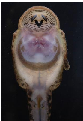
Caption: Ventral side of a tadpole ( Meristogenys stenocephalus ) with strong jaws (black) and a large ventral sucker. The animals use this to attach themselves to rocks in the current.