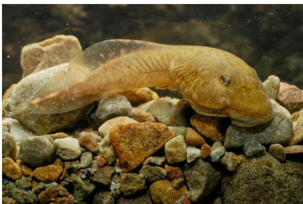
Caption: Meristogenys maryatiaae lives in the current of clear rivers in northern Borneo. They attach themselves to the substrate with their ventral sucker to avoid drifting away. The larva of this species was documented here for the first time.