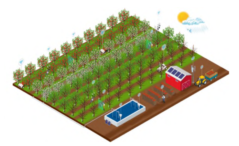
Figure 1 | Caption

www.ifam.fraunhofer.de/en/Press_Releases/Downloads.html