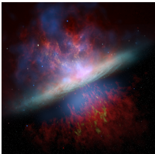
Combined image of the galaxy M81.

Top part: Observations with the Hubble Space Telescope, (cyan), Spitzer infrared telescope (red) and the Chandra X-ray satellite (blue).